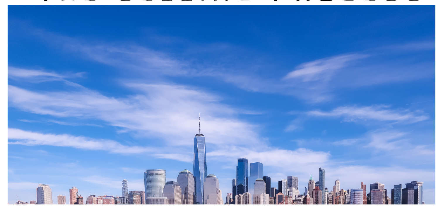
Bringing it all together